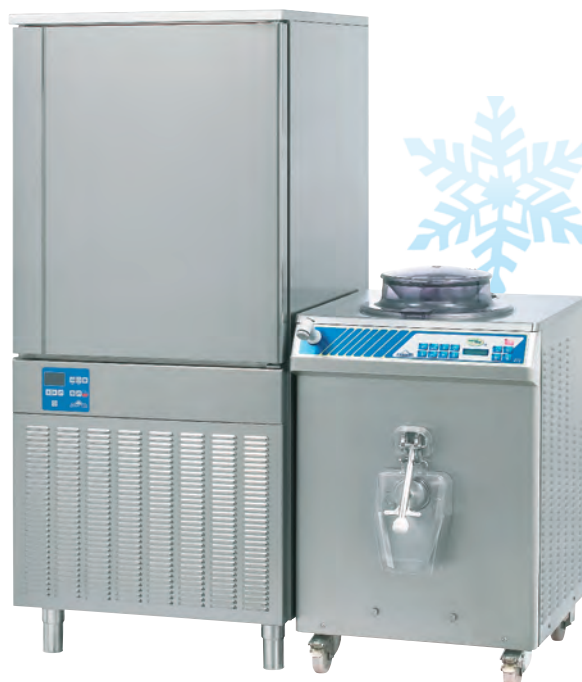
Nordika 300 Confectionery