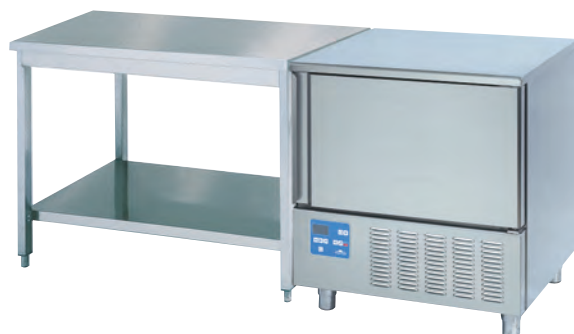
Nordika 100 Ice cream